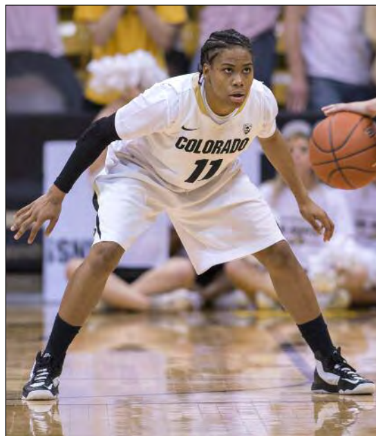
Colorado set school records for scoring defense (54.5 ppg) and FG defense (.350) in 2012-13.