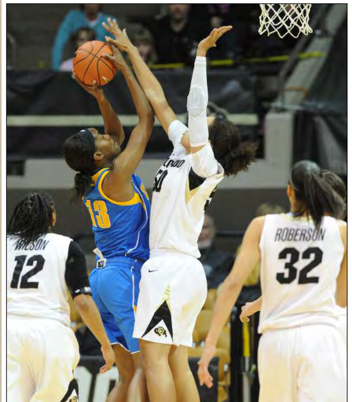
Two of Colorado's all-time best one-half defensive performances, in terms of points allowed, came in a one-week span in 2014.